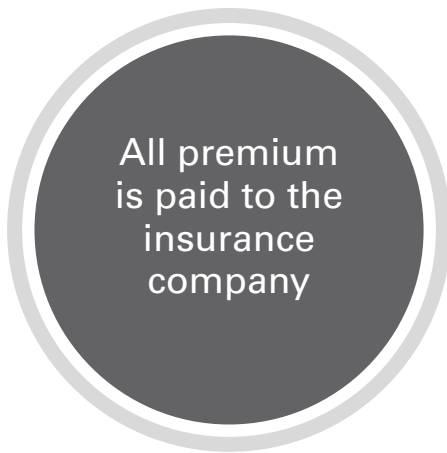
Fully insured premium

Our Self-Funded Program is different. Some of your monthly payment is used to run the daily administration of your plan, but portions of it are also used to pay your stop-loss insurance premium and to build your claims account. In years when claims are lower than expected, a portion of the difference between your group's anticipated and actual claims is credited back to you — and that adds up to significant savings.