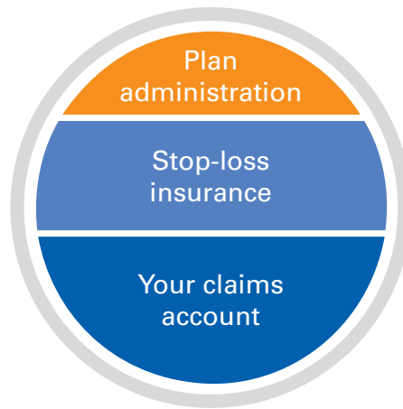
Payments for our Self-Funded Program

Receive money back from your claims account in years when claims are lower than expected